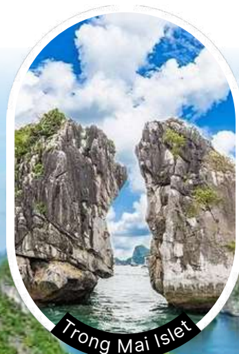
Trong Mai Islet